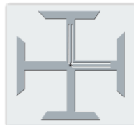
RFX6000 4x4 Read/Write Inlay

The antennas are printed or etched, depending on the antenna materials used. The most common antenna materials are: