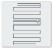
RFX6000 1x1 Read/Write Inlay

On the substrate you’ll also find the tag antenna . The antenna design is one of the most important factors in overall tag performance. As you can see from the picture below, antenna designs can vary a great deal. We’re not going to go into too much detail here except to emphasize the importance of the antenna design.