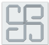
RFX6000 2x2 Read/Write Inlay